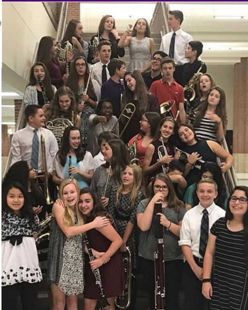
All district Band concert!

Band is a chance to unlock the musician inside and free the talent everyone has. It is a time to make new friends, see new places and soar to new heights!