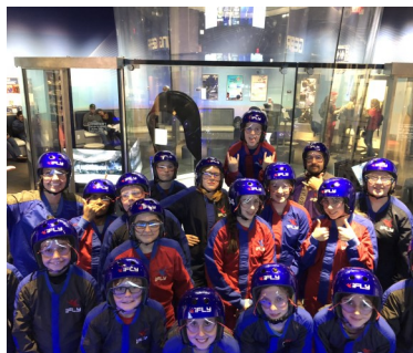
iFly fun times!

We start from scratch—no prior experience or knowledge is necessary to join the band.